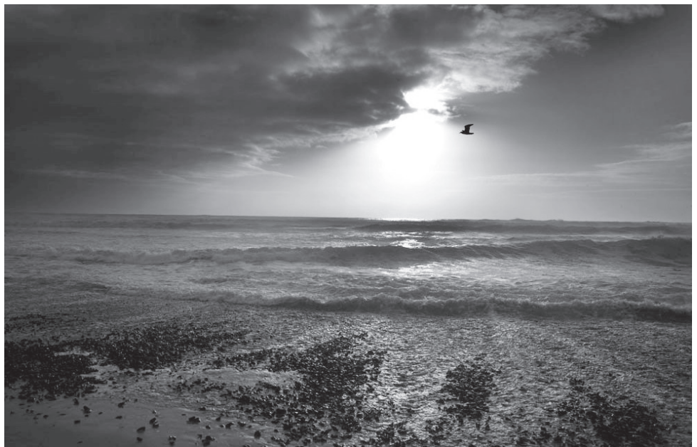
Elands Bay, 2020. Graeme Williams.

For more detail or POP louiseop2@gmail.com .